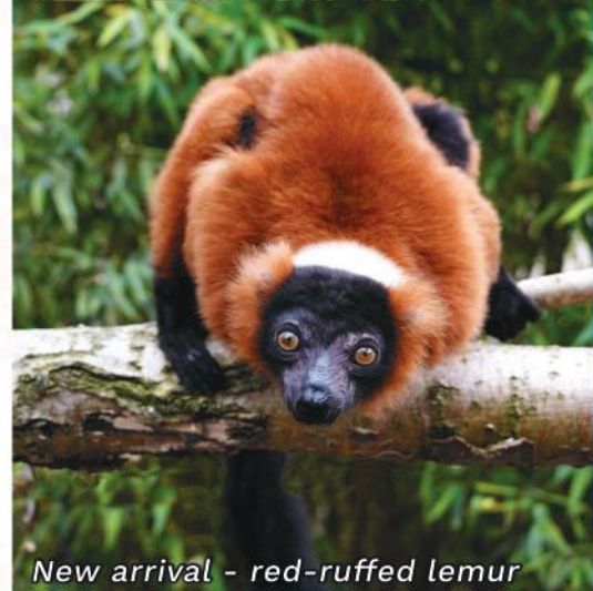
New arrival - red-ruffed lemur