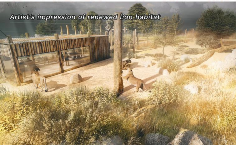
Artist's impression of renewed lion habitat

Our Andean bear group continues to thrive, following the birth of twin cubs Beni and Tuichi born in 2022 and our facility remains a key part of the international breeding programme for this species which is vulnerable to extinction according to the IUCN. We anticipate that Beni will move to another collection as part of the EEP during the next year.