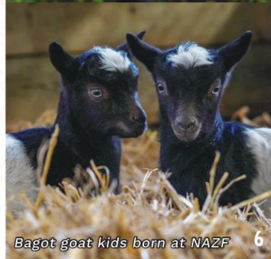
Bagot goat kids born at NAZF