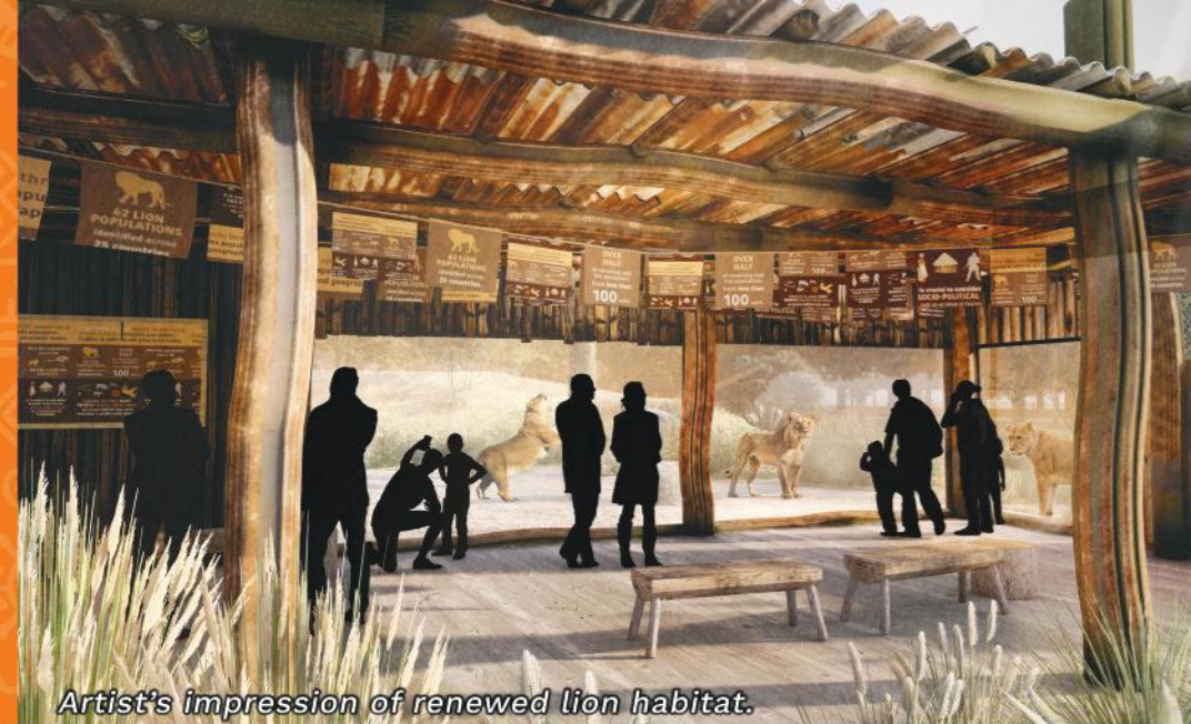
Artist's impression of renewed lion habitat.

We started a significant development of our animal welfare and conservation work with the launch of Project Carnivora to renew and enhance the lions habitat and to develop habitats for tigers, Arctic foxes and hooded vultures. This project will create best practice habitats for the carnivore species and vultures with animal care and enrichment as the top priority.