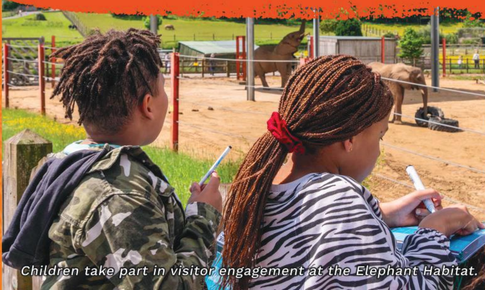
Children take part in visitor engagement at the Elephant Habitat.

Our elephant care data alongside other collections' data helped to demonstrate that the levels of elephant care and welfare have improved significantly across the UK over the past ten years to a point where the EWG's report has recommended that elephants will continue to be cared for in zoos. The new UK zoo standards for elephant care and facilities closely reflect those which have been demonstrated at Noah's Ark Zoo Farm.