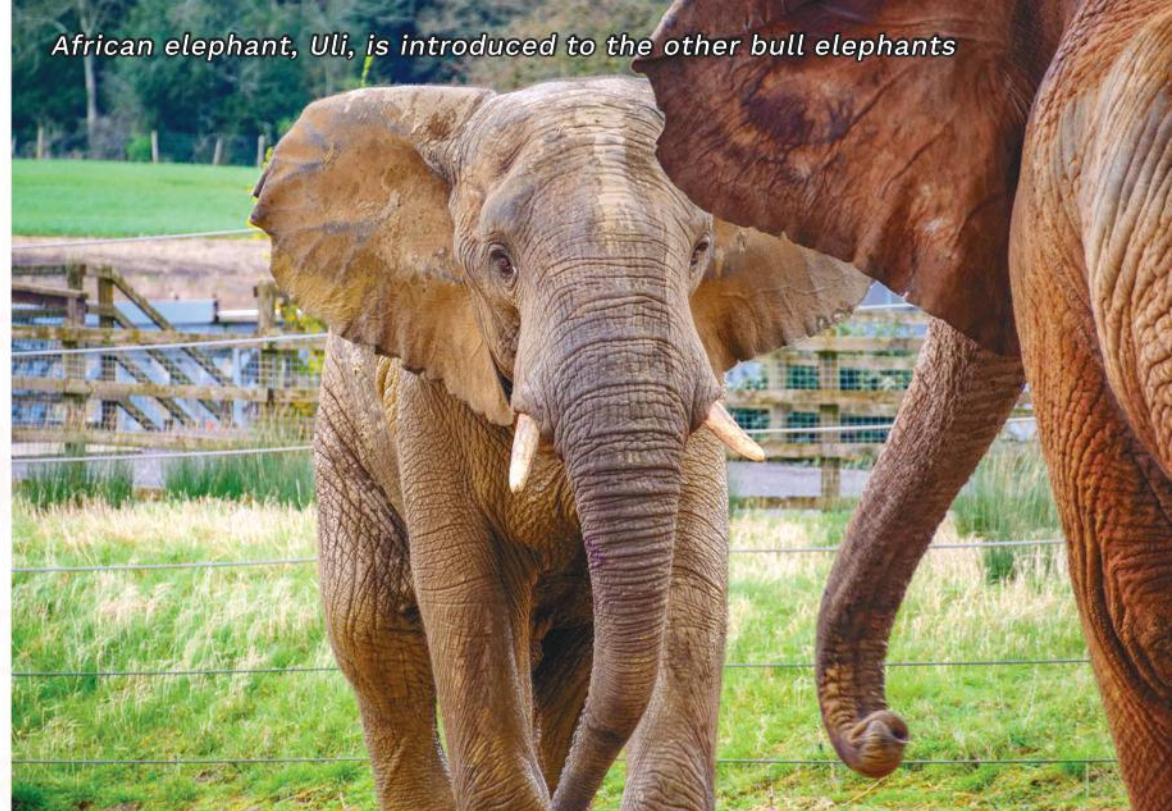
African elephant, Uli, is introduced to the other bull elephants