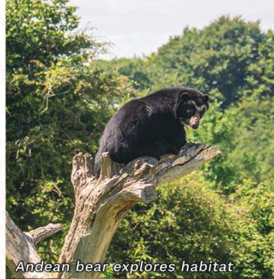
Andean bear explores habitat

Our domestic rare breed programme continues to develop as an important part of our conservation work with 22 births across the 6 species of cattle, goats, geese and sheep which we hold which are on the Rare Breed Survival Trust's Watch-list.